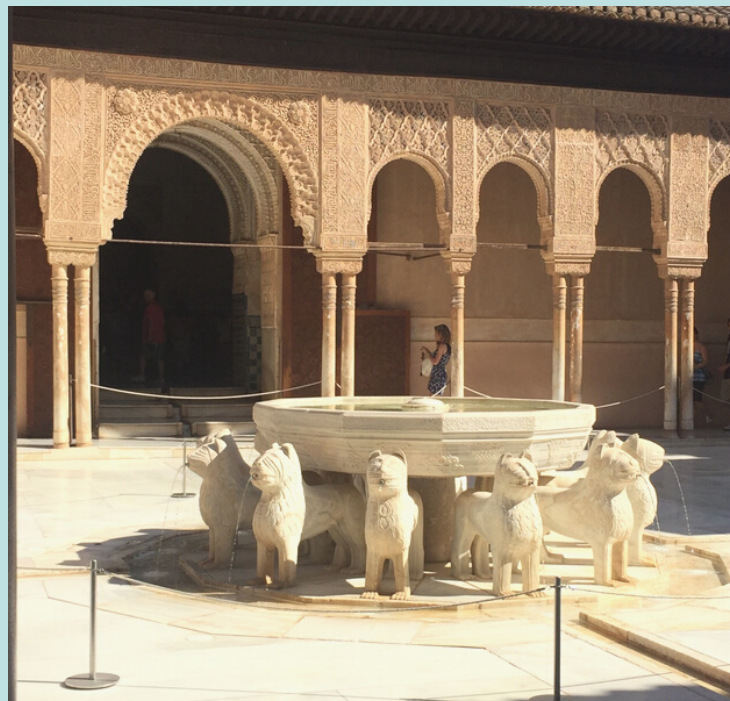
Private Visit Andalucía