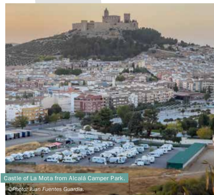
Castle of La Mota from Alcalá Camper Park.