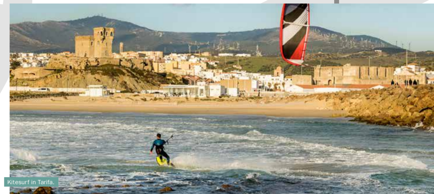
Kitesurf in Tarifa.