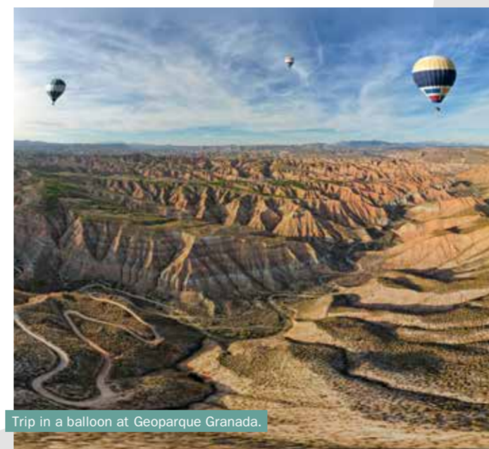
Trip in a balloon at Geoparque Granada.