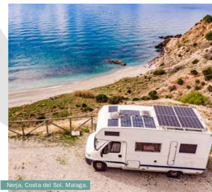
Nerja, Costa del Sol, Málaga.

If your holidays in Andalusia are over, we're sure you want to come back for more. Don't think twice, we'd love to see you back on the road at the wheel of a motor home and enjoy a holiday in our region as much or even more than the last time. Just one thing: if you do come again, bring another caravanning lover and discover Andalusia together.