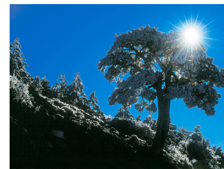
Ancient Pine tree

Discover this unknown and surprising mountain range, with peaks over 2000 metres high, snowcovered in winter and spring, with forests of ancient pine trees, high mountain meadows, abandoned mining factories as well as abandoned “berberlike” villages, creating landscapes with very scenic images.