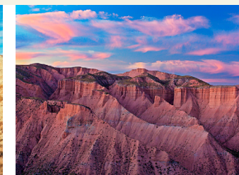
The desert at dusk