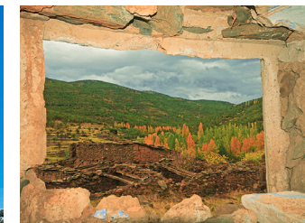
Abandoned “berber” village