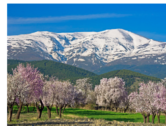
The Sierra in springtime

Discover, take pictures and hike through this surprising mountain range which contains the highest peaks of the Peninsula, covered with snow for much of the year. They will amaze you by its grandeur and breadth, its different colours throughout the year with endless possibilities for sightseeing, hiking and photography.