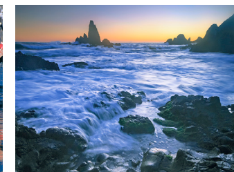
Clifflandscape at sunset